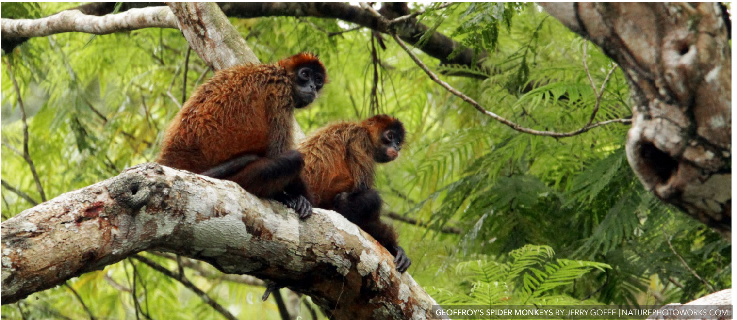
GEOFFROY'S SPIDER MONKEYS