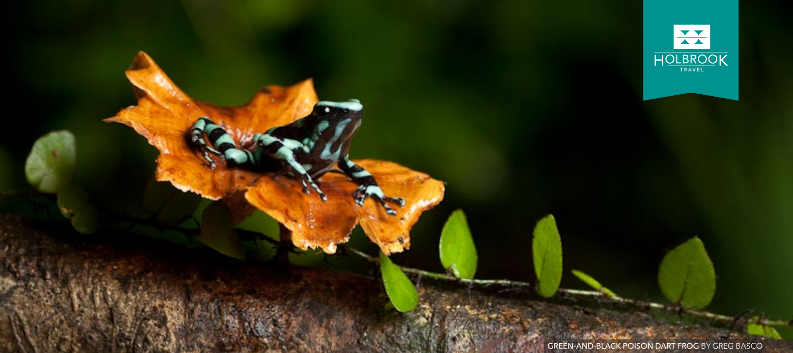
GREEN-AND-BLACK POISON DART FROG BY GREG BASCO