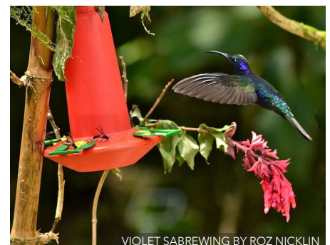
VIOLET SABREWING BY ROZ NICKLIN